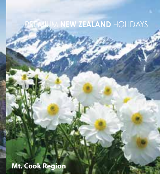
Mt. Cook Region